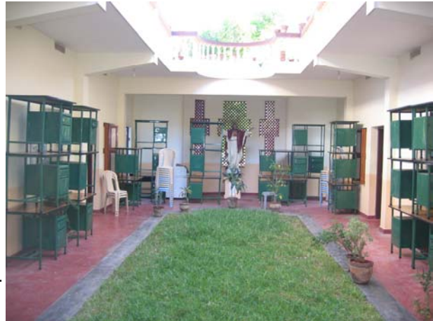
Above: The desks and chairs stacked after classes in the corridors on the ground floor of the priory in the difficult first few weeks of operation.

A Catholic curriculum was provided to Veritas Academy by the good graces of Our Lady of Victories in Idaho, USA. Most of the children cannot speak or read English, but it was still decided to make it an English medium school. More than 20 teachers were interviewed from a local Catholic teaching college and only several were found to be potential candidates. From that group one teacher was hired, two were hired from within the parish and for the rest of the teachers the priests looked inside our small house community. The six pre-seminarians had recently finished one year of classes and it was decided that they could now help with the teaching of the children. The prior would teach a Bible History class to the older students and the pre-seminarians would teach