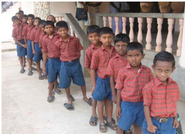
Above: The boys anxiously awaiting dismissal.

basic English, Latin, Tamil, Hindi and some mathematics. Utilizing the helpful books sent by Our Lady of Victories (and C-Link), the children (spread from grades 1 – 7) would be given two separate English classes each day (English grammar and speaking English). Further, they have a Catholic science class, Bible history, Latin, Hindi, Tamil, and Mathematics. Once a week the girls are given a sewing class and the boys are given a singing class.