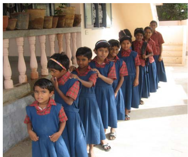
Above: The girls lineup before the first class.

The first quarter of school was recently completed and the progress of the children is a source of consolation to the teachers and priests. All the children and teachers at Veritas Academy continue to beseech your prayers for the continuance of this humble school which is trying to forge a new path within the Indian education system. It is not by chance that the name and motto “ Ego Sum Via, Veritas et Vita ” were chosen. Truly, it is in this country that we have such need of Our Lord and His truth. “I am the Way, the Truth, and the Life.”