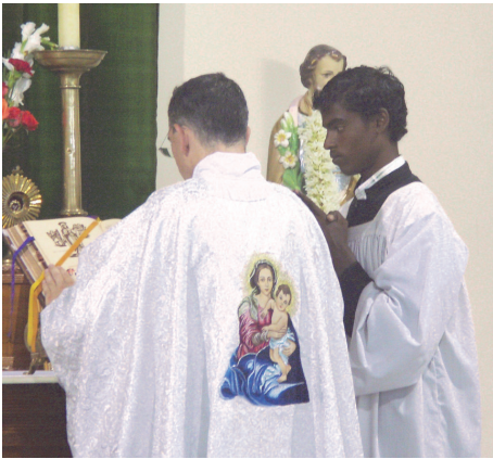
New vestments on the Feast of the Immaculate Conception.