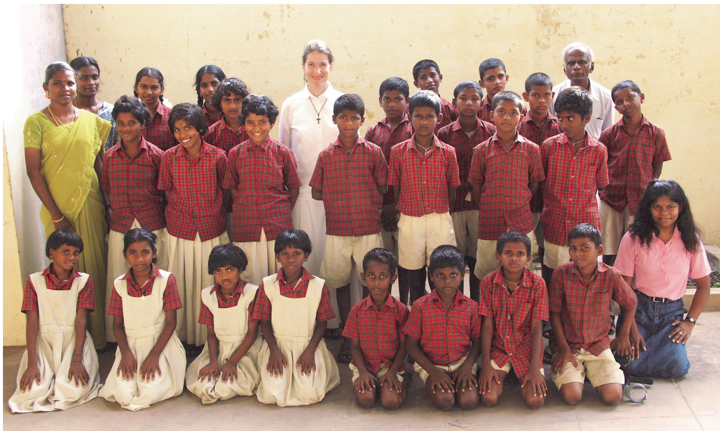
Veritas Academy, December 2007.