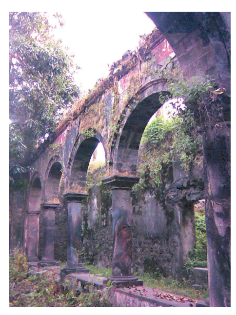
The ruined cloister of the Jesuit College where St. Gonsalo Garcia was educated.