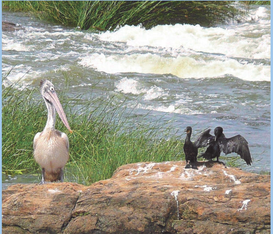
"And the Pelicans think we're ugly," said the Little Cormorant to his friend.