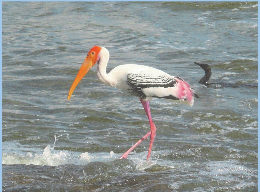
A colourful Painted Stork (with a Little Cormorant in the background) enjoying the flood waters of the unexpected second monsoon.