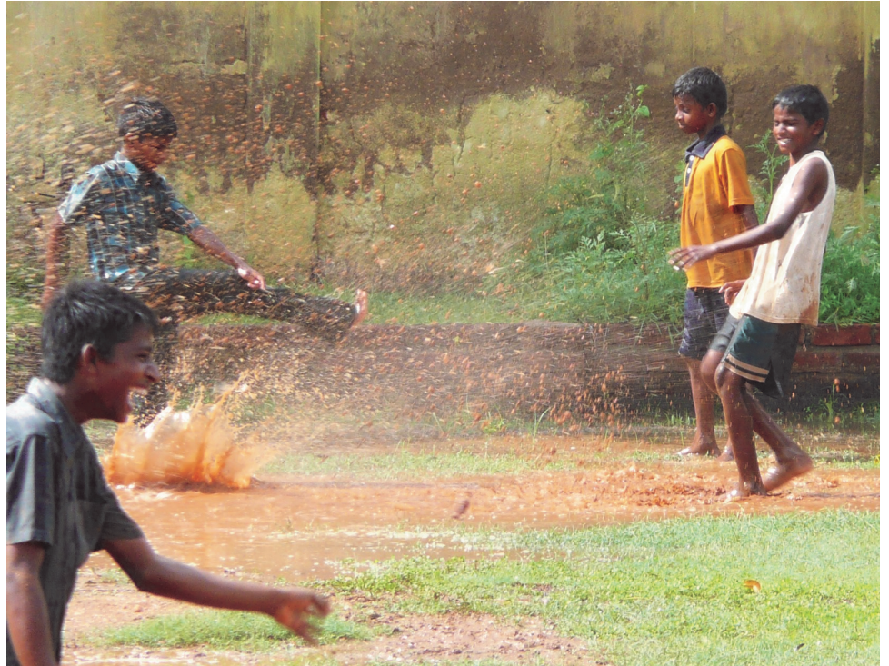
The boys play 'Catch the Flag' in the muddy grounds of the priory.

fire at the dam. The second lesson concentrated on the delicate creation of paper aeroplanes. These were then tested from the roof of the priory.