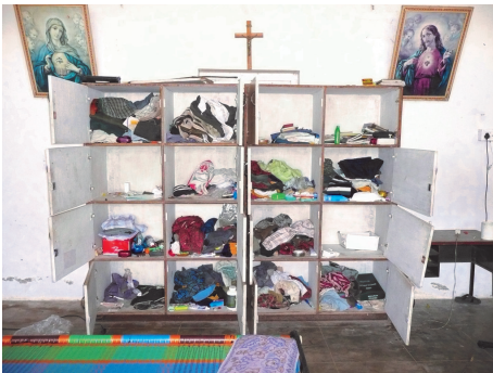
A surprise locker inspection reveals alarming disorder in the boys' dormitory. Each boy has one locker containing his wardrobe and treasured possessions.