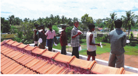
Flight testing from the roof of the priory. The fancier designs tended to fair worse.