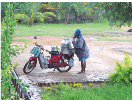
The Priory Milkman. Milk is delivered unpa- steurised and so must be boiled on arrival.