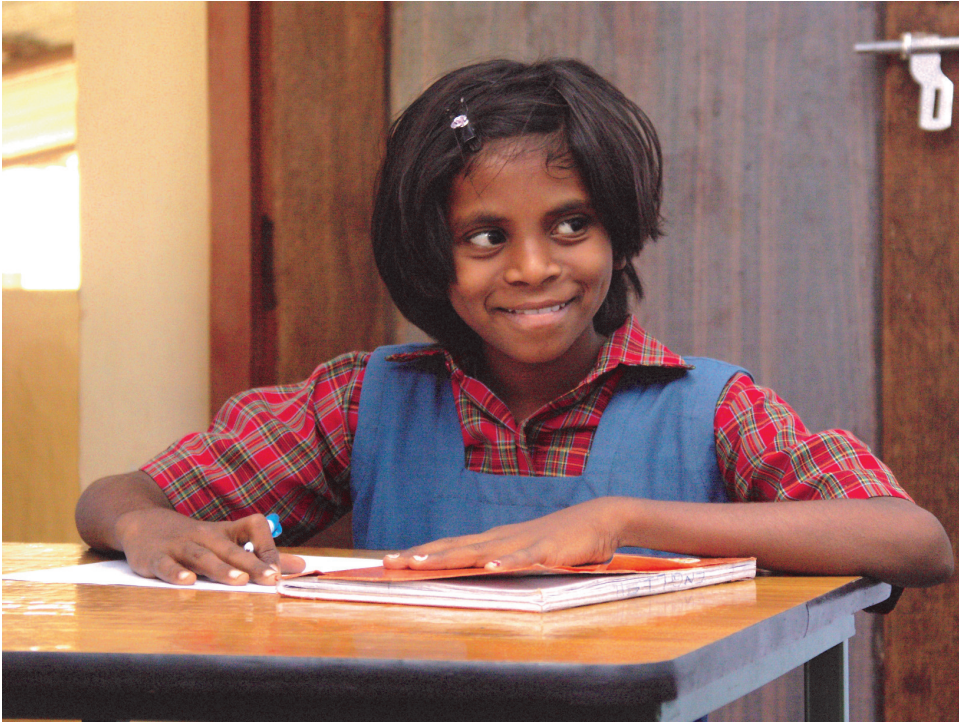
Mary Magdalene is clearly up to something.

we have in our teaching staff. We visited three colleges in total and asked for Catholic candidates only. Regrettably we found only three suitable candidates from twenty interviews and two of these failed to show up for their teaching test. It seems that Providence is telling us that we need more volunteers from abroad. We need teachers of English, Science and Geography. The vacancies arise due to the