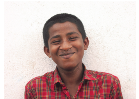
Laughing is also frowned upon.