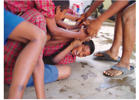
Violent games are strictly banned at Veritas Academy.