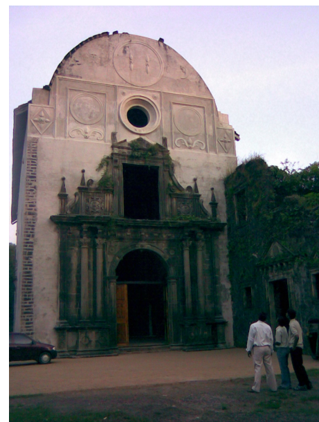
The facade of St. Gonsalo Garcia.