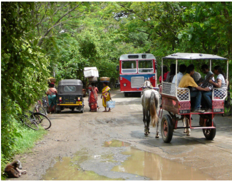
Horse drawn rickshaws on the peninsula of Gorai, where some of our faithful live.