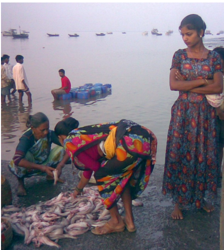
Fishermen bring their catch ashore to be sorted and gutted by their wives and daughters. Note the Portuguese style of dress. The old Portuguese culture is still very evident in Vasai even though the Portuguese left in 1739 after a 3 year siege.