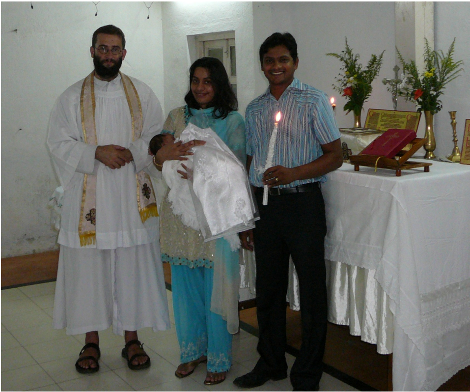
Baptism at the Pioneer Hall in Bandra, Bombay.