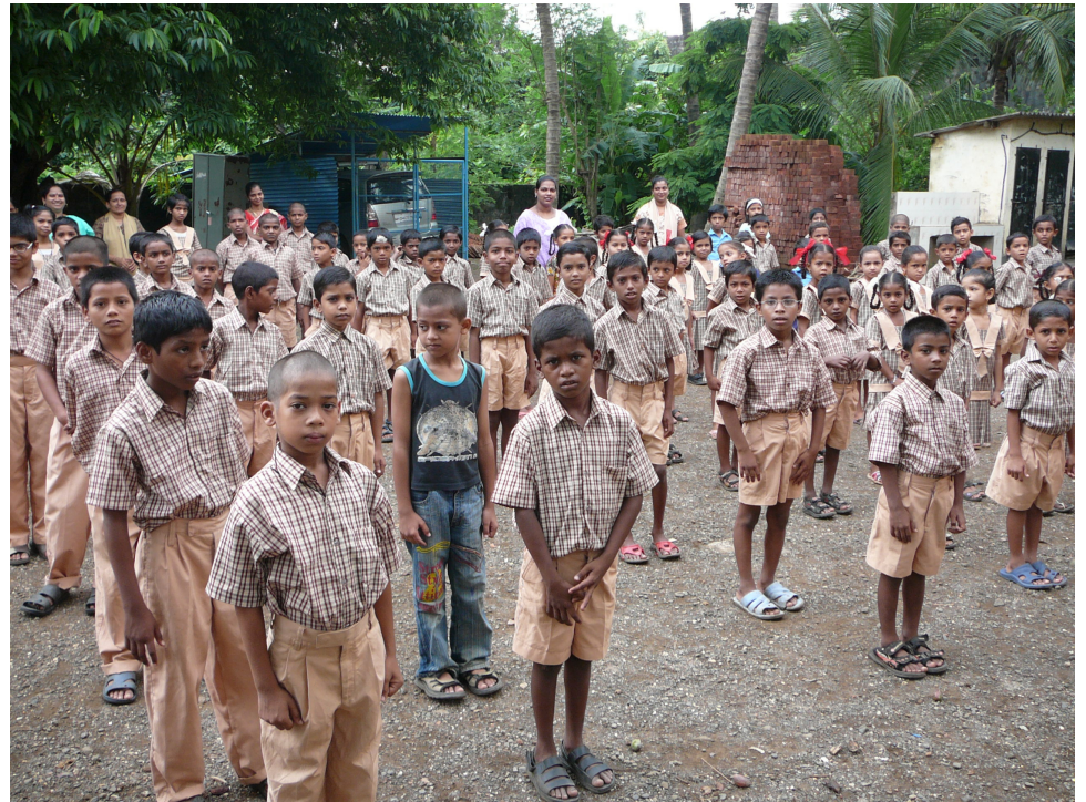
The orphans of the St. Gonsalo Garcia Orphanage in the Bassein Fort of Vasai. One ugly duckling shall find his uniform in a few weeks time.