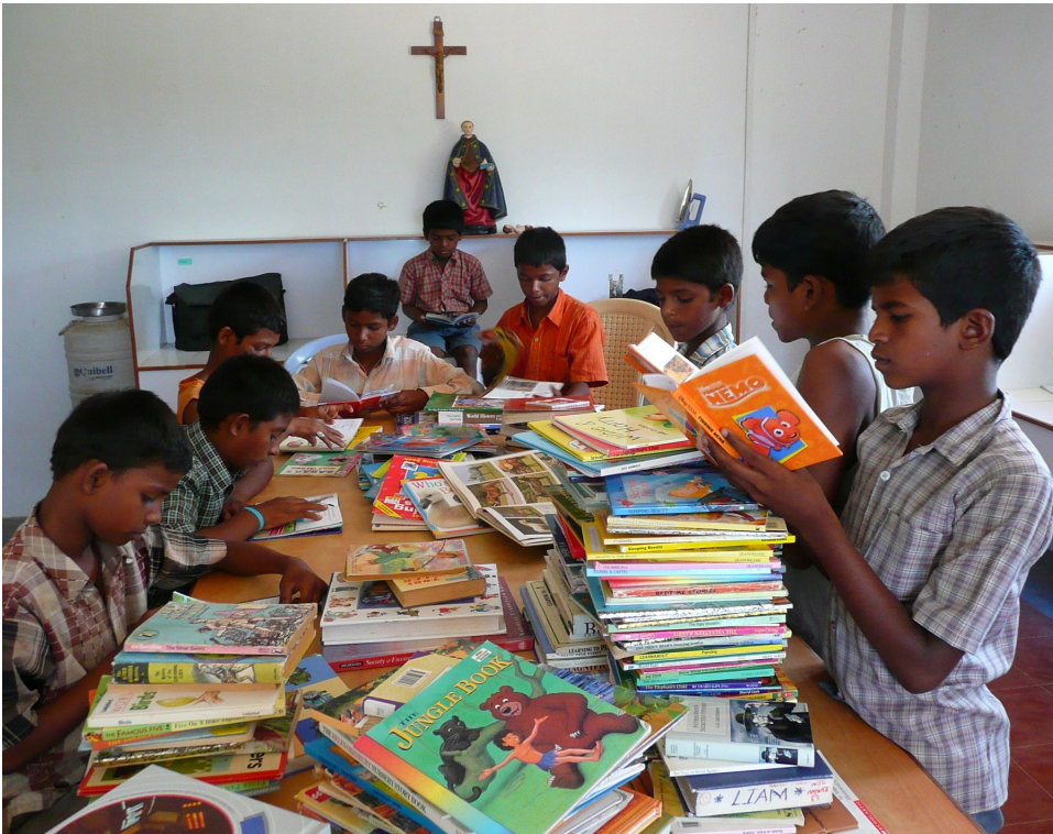
Some of the boys examine the new books that have arrived from our devoted faithful in Melbourne, Australia. Reading is the bread and butter (or rice) of education.