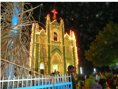
The illuminated Chapel of St. Anthony.