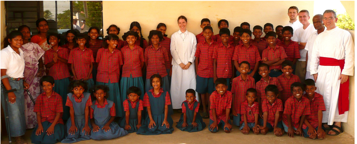
Veritas Academy 2008-9