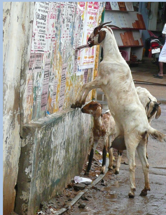
Ultimate recycling. When it rains, the rice paste glue turns a poster into a meal. Is this the future of advertising?