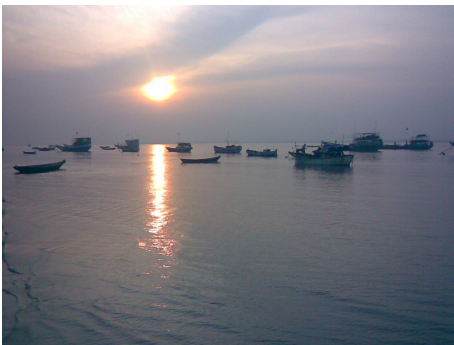
Outside the walls of Bassein Fort is a fishing village. This picture was taken at 6:30am.