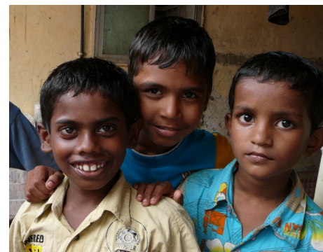
Tamil orphans all the way up north too.

Please pray that this new venture be blessed