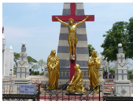
St. Thomas Mount, where St. Thomas the Apostle completed his martyrdomed, Chennai.