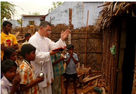
The houses of the faithful are blessed every year in the village of Singamparai as part of the festival.