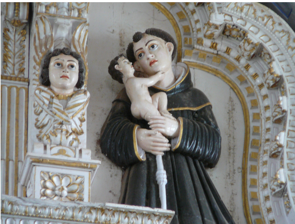
A touching St. Anthony & Child in Goa. Throughout India there is a great devotion to the saint.