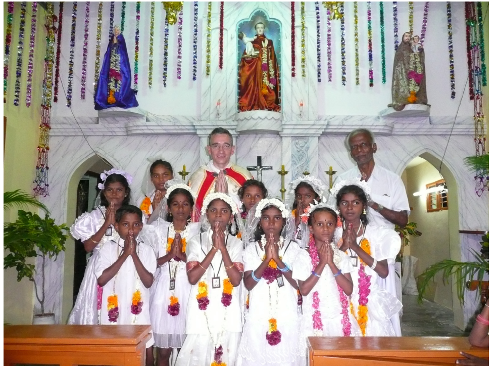
There were ten First Holy Communions on the last night of the festival.

■ 22nd July—3rd August. Many chapels in Tamil Nadu honour their patron saints by a festival lasting 13 days. The start of the festival is marked by the raising of a flag on a decorated flag pole. The