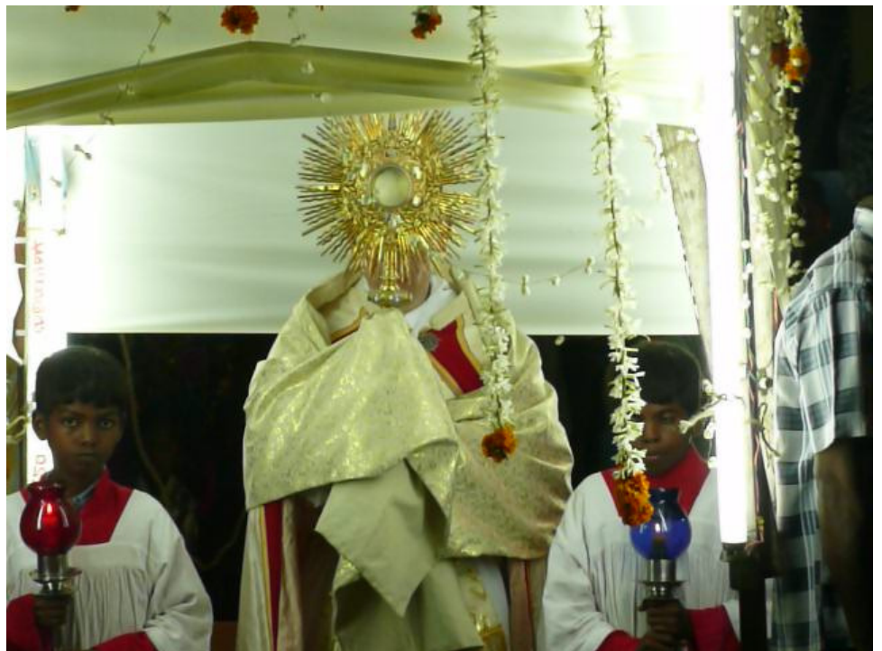
Ave Verum Corpus Natum de Maria Virgine.

climax is the procession of the Blessed Sacrament followed by the pulling of a decorated carriage through all the streets of the village. The festival is closed by lowering the flag and endless fireworks.