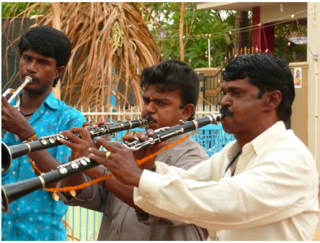
The band warms up for the big night.