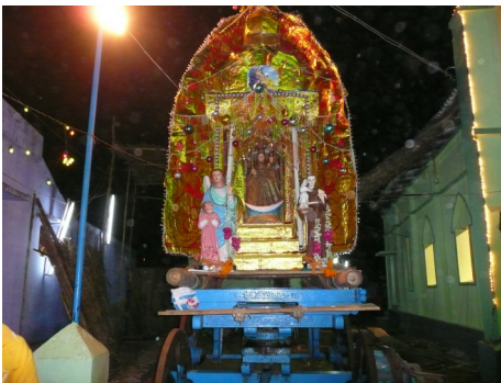
The statues of the Madonna & Child, St. Anthony & the Infant Jesus and The Guardian Angel on the decorated carriage.