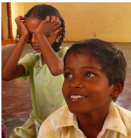
Weariness in class can happen.

con Claude Frolo holds a book in his hand and says, pointing to the book, “This will destroy that”, pointing then upwards to the Cathedral. He prophesied the destruction of the Church by the dissemination of error through the printed word. The protestant errors did indeed spread by means of the printed word launched on a population that were becoming increas-