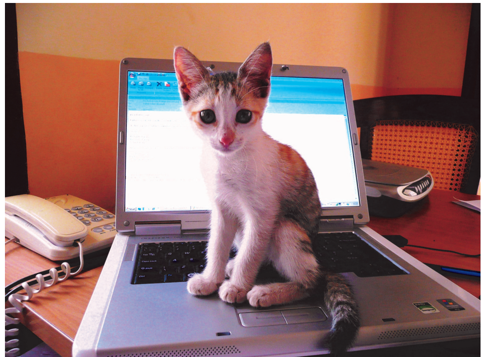
“Now listen Father! It’s either me or the computer.” Magnificat, the new priory rat catcher, puts her paw down.