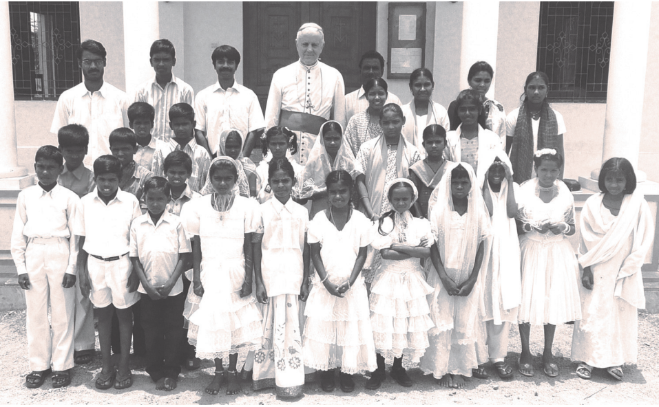
Young confirmands from the orphanage and Mass Centres served from Palayamkottai.

The next stop on the pontifical tour was Palayamkottai. On Sunday 24th August, 30 souls received the sacrament of confirmation and were treated to a conference by His Lordship in the afternoon on the dangers of the modern world which are now changing the face of India (television, cinema, modern fashions,