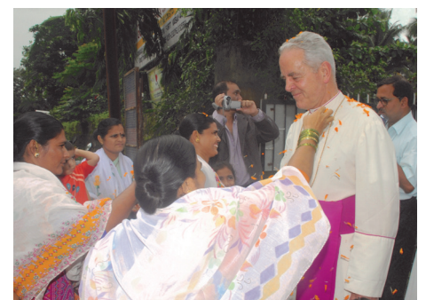
A shower of petals after Mass.

The next day, Sunday, after many days of meticulous preparation, 15 souls received the sacrament of confirmation in front of 400 faithful at the partially restored St. Gonsalo Garcia Church in the Bassein Fort at Vasai (north of Bombay). His Lordship processed to the church from the sacristy located in the neighbouring ruins of the Church of the Immaculate Conception.