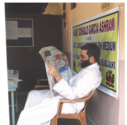
Business as usual.