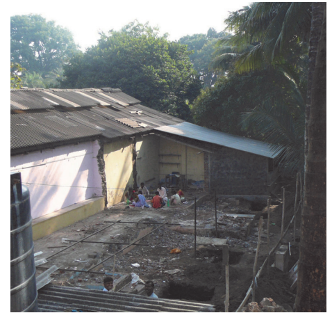
Construction at the new priory is underway.

The Northern Circuit continues to blossom anew. The first overseas teacher has been engaged at the St. Gonzalo Garcia Orphanage school to and plans to take-over the running of the orphanage and school are being discussed. Ω