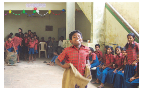
One of the competitors on "Children's Day" at Veritas Academy. Throughout India, classes are replaced by games to give everyone the chance to make even more noise. The children enjoy it.

foresaw from all eternity the plunge in building commodity prices (iron, steel and cement) at the onset of the current global recession and may have deliberately stayed our hand until those price falls filtered down to the Palayamkottai market. This is yet another example of how the Catholic Faith can make sense of the tumultuous world in which we live. Ω