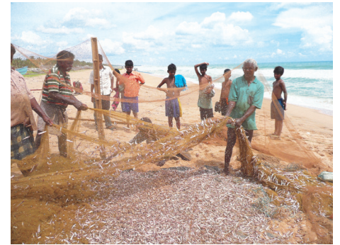
On a visit to the south coast, the boys watch some fisherman shake the small fish (sprat) from their nets. Afterwards they spent two hours in the crashing waves.