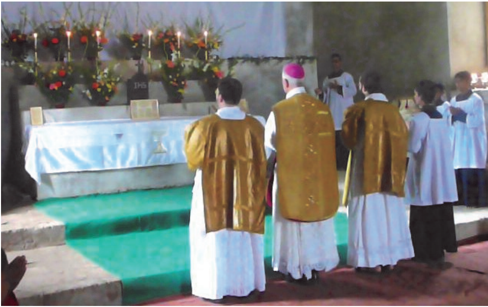
“Introibo ad altare Dei” before the high altar of St. Gonsalo Garcia Church.