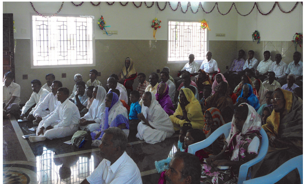
The faithful during the sermon.

A confirmand receives an eternal character upon her soul, designating her as a soldier of Christ.