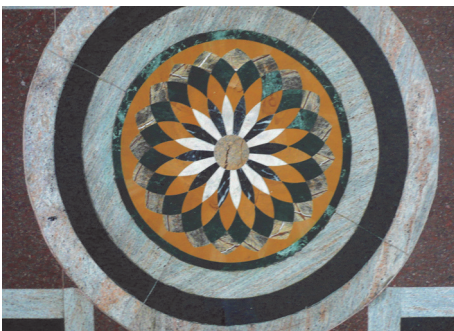
Floral decoration in polished granite.