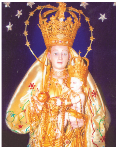
Our Lady of the Snows, Tuticorin.