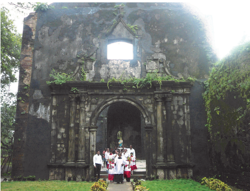
On the feast of the Assumption, the faithful of Vasai process with a statue of Our Lady from the ruins of the Immaculate Conception Church in Bassein Fort.