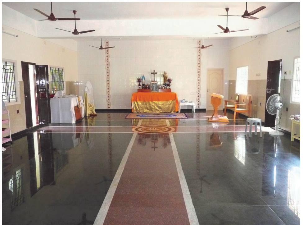
The interior of the new chapel. The floor is made of polished granite.

the utilities. This was while he was running his own demanding business at the same time. May God grant all those who helped a rich reward.