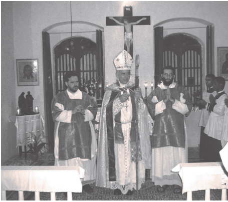
Confirmations at Salvador do Mundo, Goa .

On Monday afternoon His Lordship, escorted by the two priests of the North, departed for Goa to visit the decaying splendour of what was once the 'Rome of the East.' It is heartbreaking to see how this verdant arm of the Church has withered since the Second Vatican Council and the annexation by India in the sixties (Hinduism is being heavily promoted by the state as a national religion).