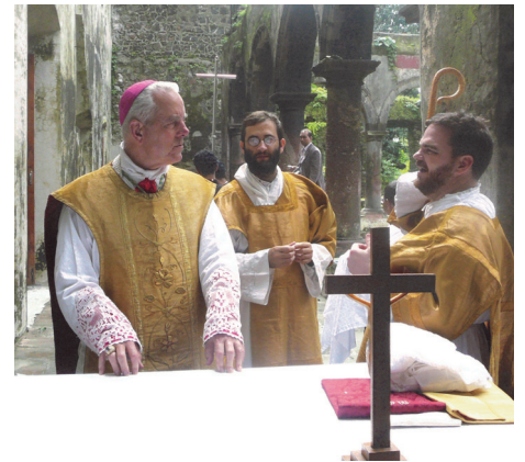
In the sacristy: “My Lord, do you mind if I borrow this crosier for a minute, I need to whack one of the boys over there?”