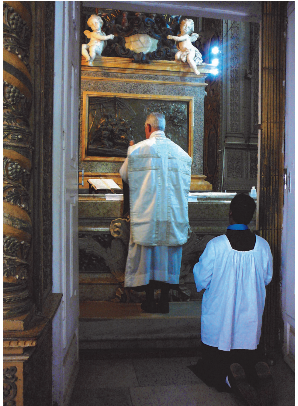
The Holy Sacrifice of the Mass upon the tomb of St. Francis Xavier in Bom Jesu, Goa.