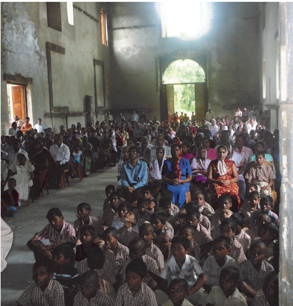
Angelic orphans from the St. Gonsalo Garcia Ashram listen attentively to His Lordship’s sermon.