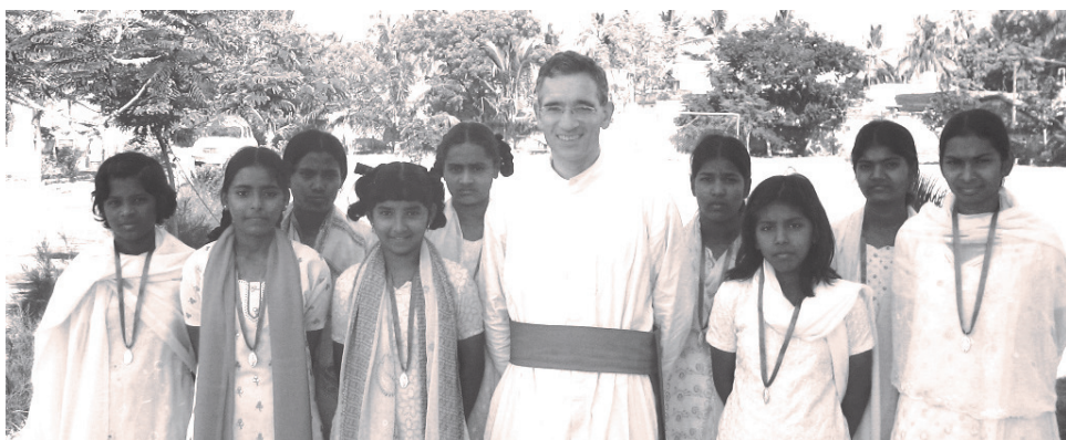
Nine young ladies became the first Children of Mary at Palayamkottai on the Feast of the Immaculate Heart of Mary. The purpose of the Sodality of the Children of Mary is to encourage its members to become true “handmaids of the Lord” by imitating the virtues of the Blessed Virgin Mary.