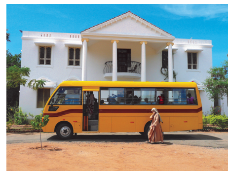
The bright, shiny, new orphanage bus is a welcome addition to the orphanage fleet consisting of a jeep, 2 scooters and 4 bicycles.