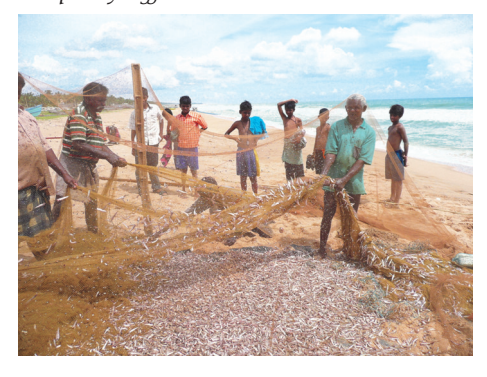
On a visit to the south coast, the boys watch some fisherman shake the small fish (sprat) from their nets. Afterwards they spent two hours in the crashing waves.