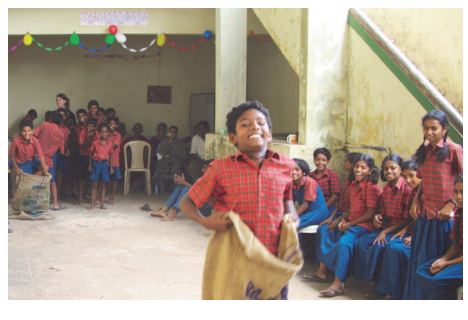
One of the competitors on "Children's Day" at Veritas Academy. Throughout India, classes are replaced by games to give everyone the chance to make even more noise. The children enjoy it.

foresaw from all eternity the plunge in building commodity prices (iron, steel and cement) at the onset of the current global recession and may have deliberately stayed our hand until those price falls filtered down to the Palayamkottai market. This is yet another example of how the Catholic Faith can make sense of the tumultuous world in which we live. \Omega