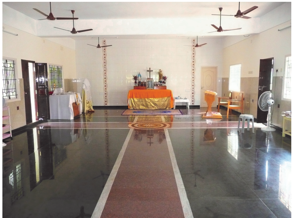
The interior of the new chapel. The floor is made of polished granite.