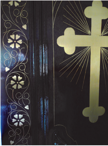
Solid Burmese teak doors inlaid with brass were donated to the chapel.

After two years of planning and construction, the new chapel at Trichy (300km north of Palayamkottai or six hours by train) was unveiled on the occasion of His Lordship's visit to India.