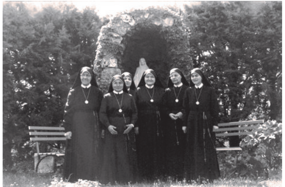
The beginning of a new chapter: The sisters who remained faithful to their Congregation in 1996.