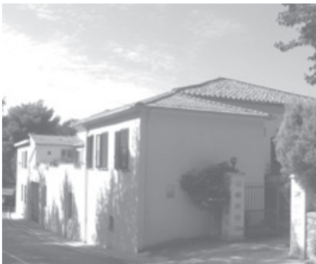
The convent in Vigne is on a hillside on the edge of a village

The apostolic goal of the Institute is to dedicate itself to Christian formation—particularly of children and female youth, and to help the priestly apostolate in its many diverse forms.