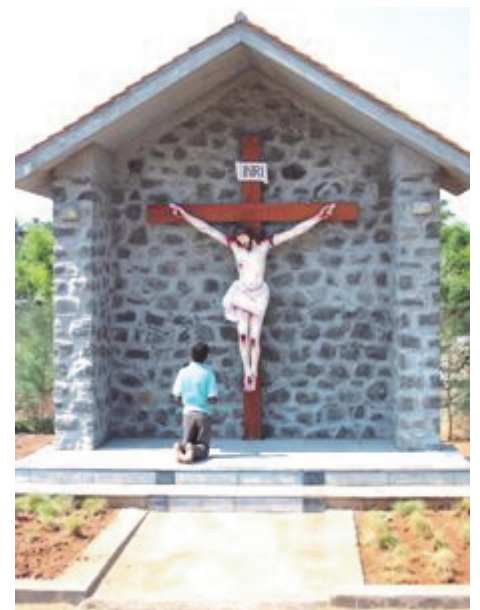
A damaged Corpus was repaired, a cross was made and a shelter built just in time for Good Friday at the Priory.