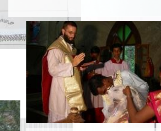
The solemn moment of putting the marriage chain around the neck of the bride.

Like many great artists, however, he laments the limitations imposed upon him by "unimaginative, calculating administrators" two of his biggest projects went up in smoke.