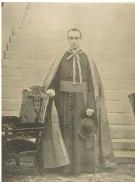
Monseigneur Merry del Val as the very young Apostolic Delegate to Canada in 1897.

The edition is also a compelling on account of the new translations of prayers and letters of spiritual direction previously only available in Italian. One of the many apostolates which the Cardinal supported after the death of Pope St. Pius X in 1914 was the cause of traditional femininity and womanhood. Three major addresses in Rome, published here for the first time, are prophetic and apocalyptic by turns. Lambasting the degeneration of