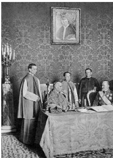
Cardinal Merry del Val assisted by Eugenio Pacelli signing the Concordat with Serbia on 24th June 1914.

morality, the rise of frivolity and the transformation of woman into a plaything, the Cardinal exhorts the resistance movement of traditional womanhood to remain true to the Church's teachings on the sacrament of marriage. What would