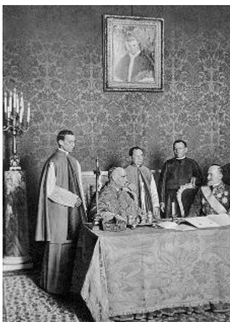
Cardinal Merry del Val assisted by Eugenio Pacelli signing the Concordat with Serbia on 24th June 1914.

morality, the rise of frivolity and the transformation of woman into a plaything, the Cardinal exhorts the resistance movement of traditional womanhood to remain true to the Church's teachings on the sacrament of marriage. What would