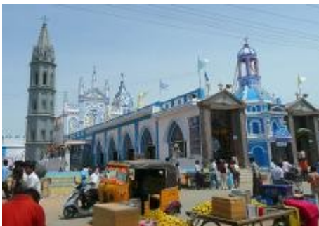
The 5th August is a holiday in Tuticorin where 50% of the population are Catholic..