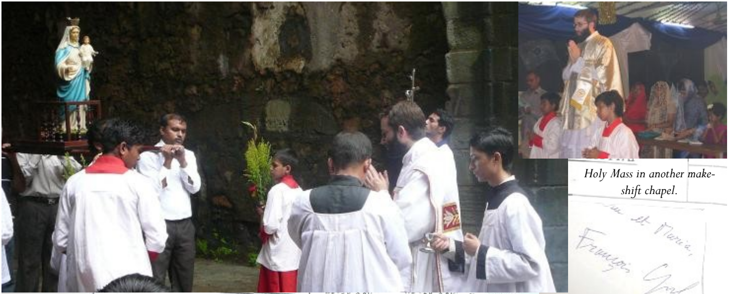
Holy Mass in another makeshift chapel.