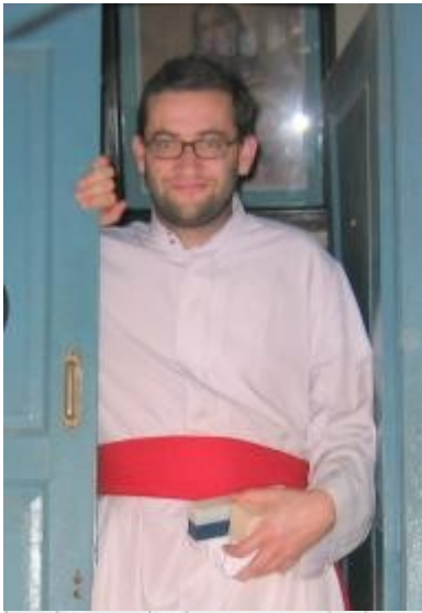
Fresh faced in 2002.