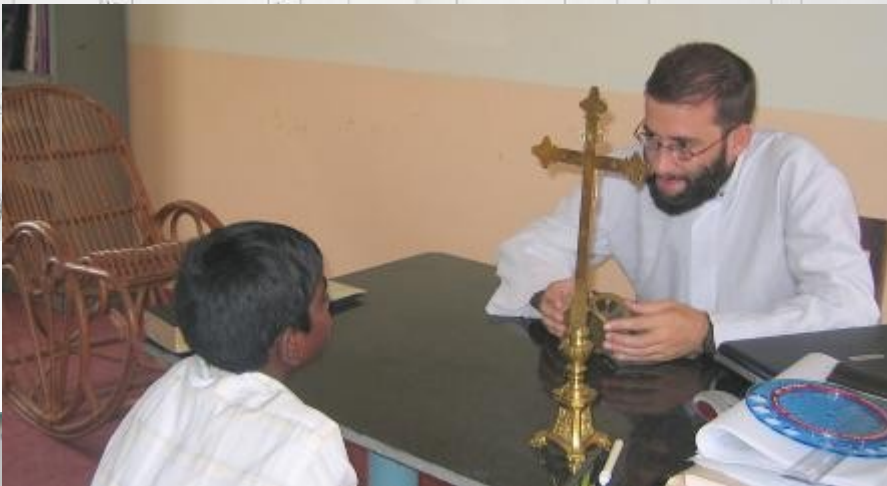
So what's Confirmation?.

Like many great artists, however, he laments the limitations imposed upon him by “unimaginative, calculating administrators”—two of his biggest projects went up in smoke.