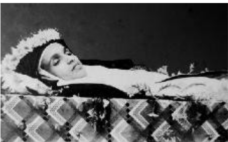
Saint Alphonsa Muttathupadathu. 19th August 1910 – 28th July 1946