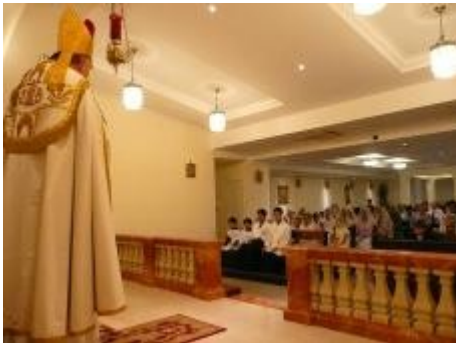
“This is none other than the House of God and the Gate of Heaven.”

From 1999, when the Society first established its Asian District Headquarters in Singapore, the priory has been situated in a rented apartment, but after many prayers and some heroic generosity on the part of the faithful, this new property was