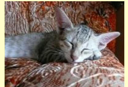
This is the new cat, Benedicat. Remarkable evolutionary adaptation has made her quickly blend-in with the armchair in the entrance hall.