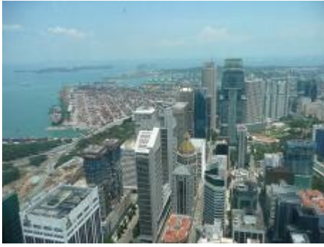
Singapore: gateway to the East.