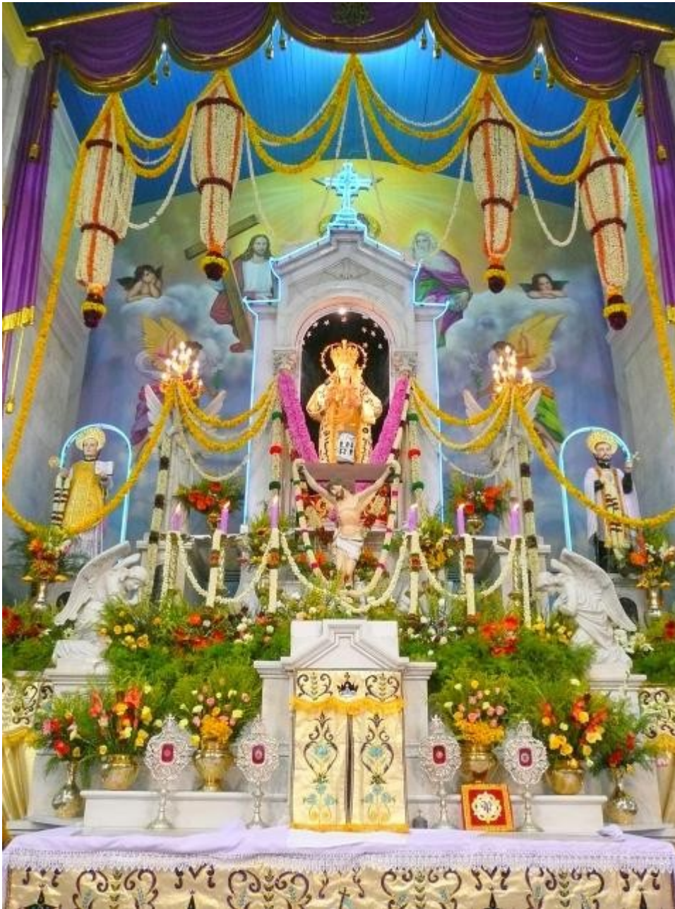
The high altar of the Basilica of Our Lady of Snows on her feast day (5th August). The Basilica was built in 1713