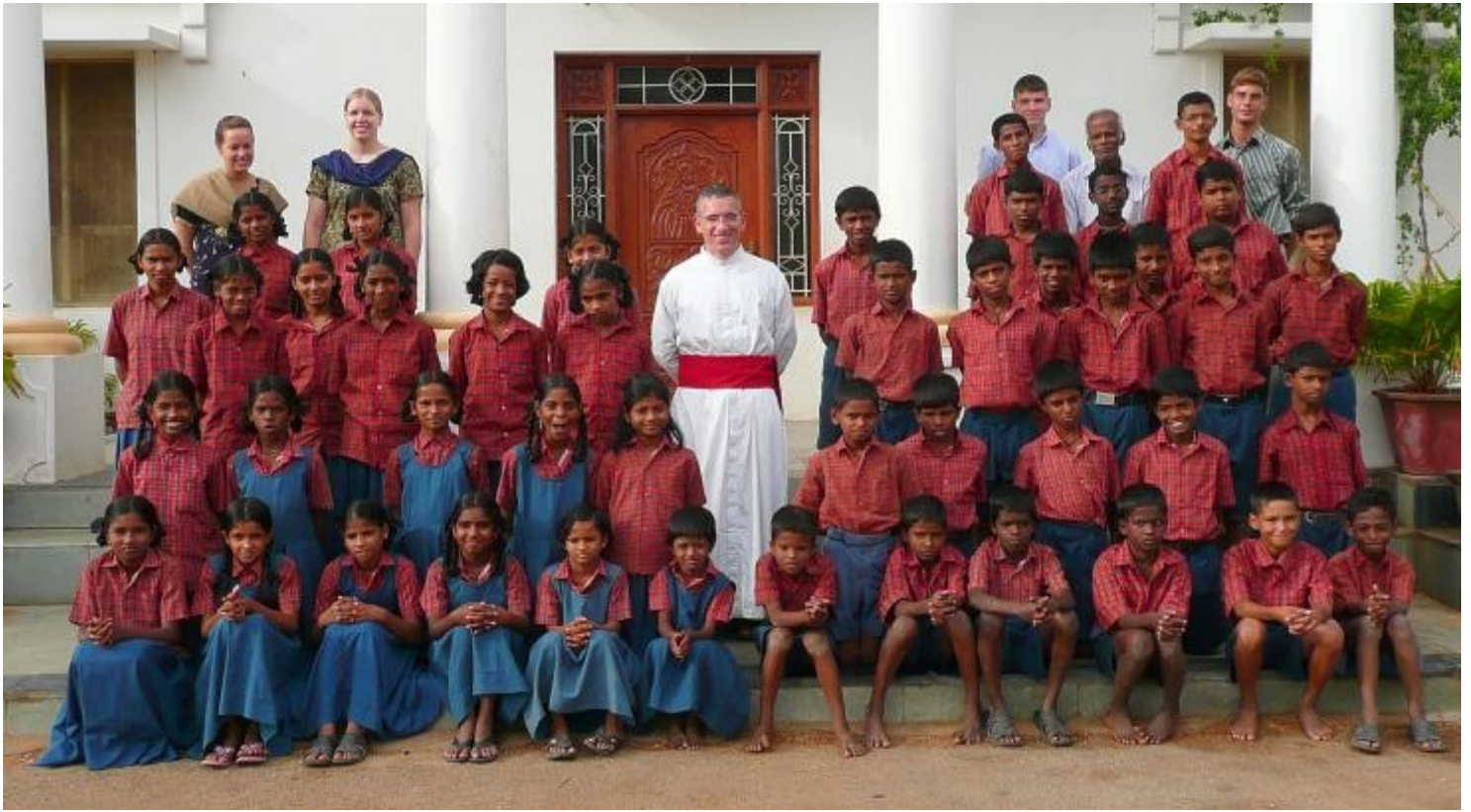
Veritas Academy 2009-10 in blossom.