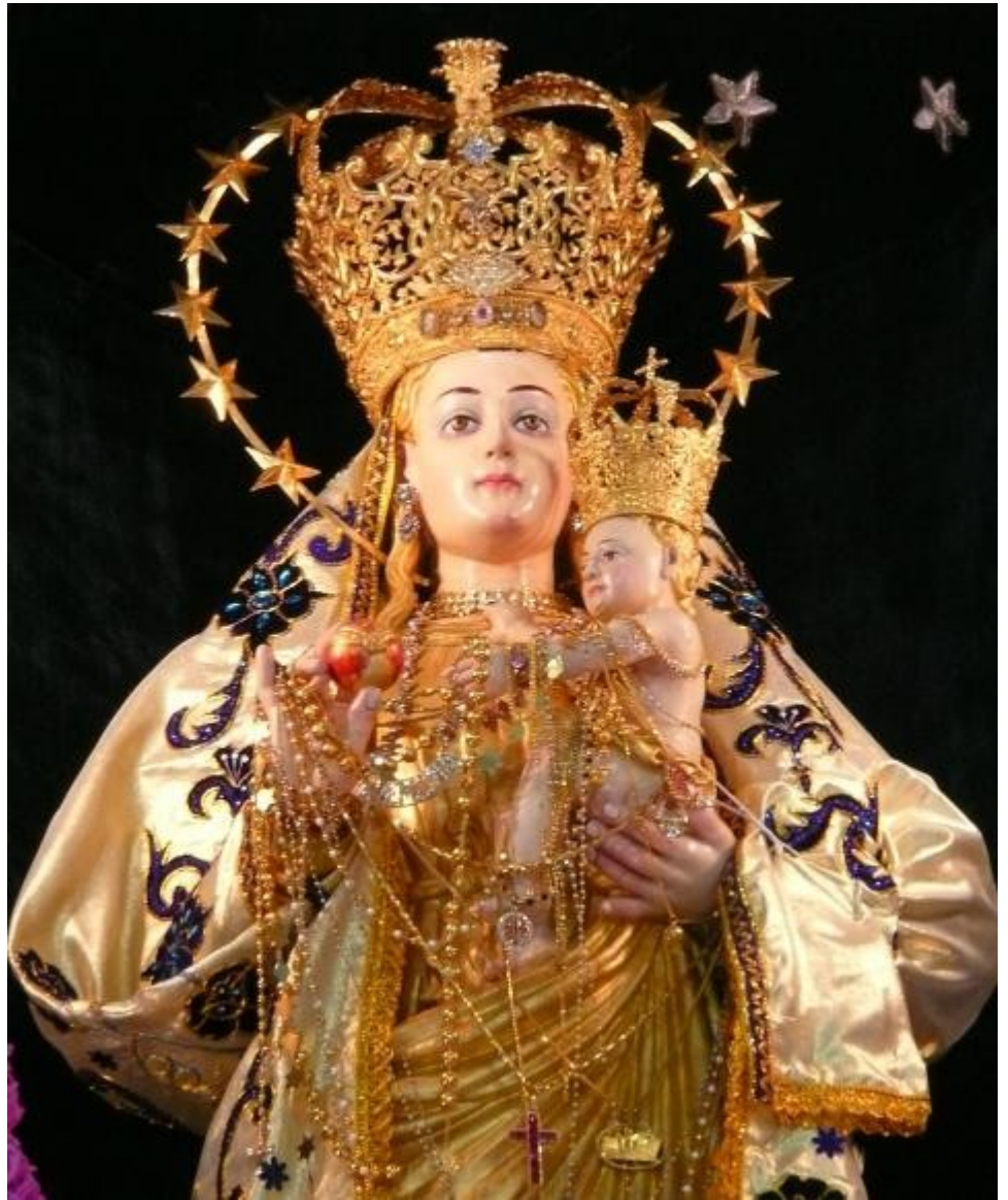
The beautiful statue of Our Lady of the Snows is almost 500 years old and is still the object of great veneration. It is wonderful to think that St. Francis prayed before this statue to which many miracles have also been attributed .