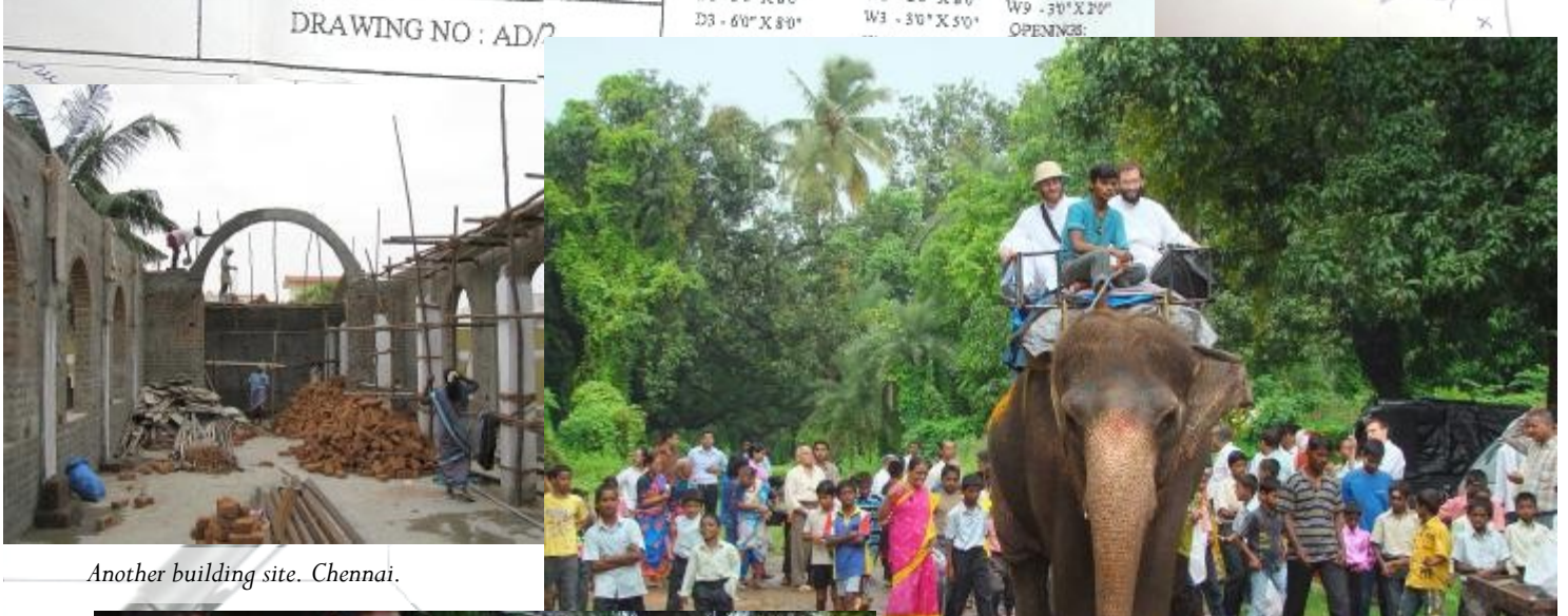
Another building site. Chennai.