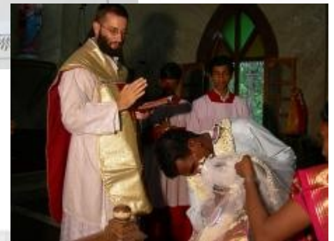
The solemn moment of putting the marriage chain around the neck of the bride.