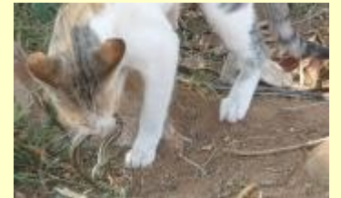
Sadly Magnificat the priory cat has vanished; we suspect that she tried to eat one snake too many.