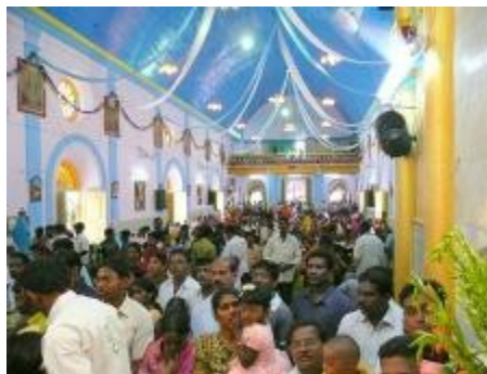
A holy throng of faithful come to pray to Our Lady of the Snows on her feast.