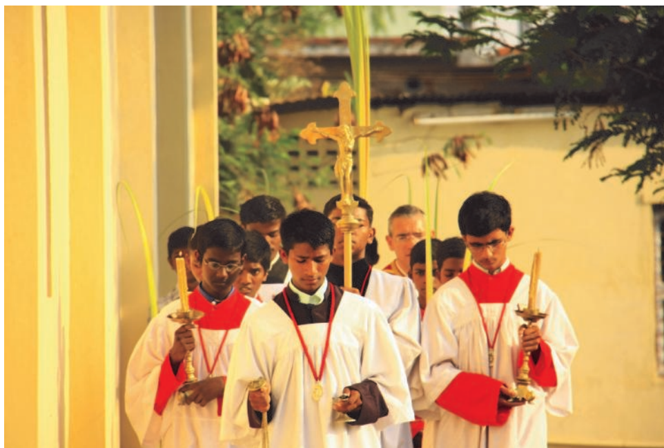
Palm Sunday at Palayamkottai.