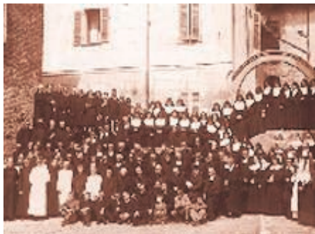
From 1 st to 4 th September 1946, the majority of the 323 priests and religious met in their village of Lu for a reunion which attracted world-wide attention.

The prayer that the mothers of Lu prayed was short, simple, and deep: “O God, grant that one of my sons may become a priest! I myself want to live as a good Christian and want to guide my children always to do what is right, so that I may receive the grace, O God, to be allowed to give you a holy priest! Amen