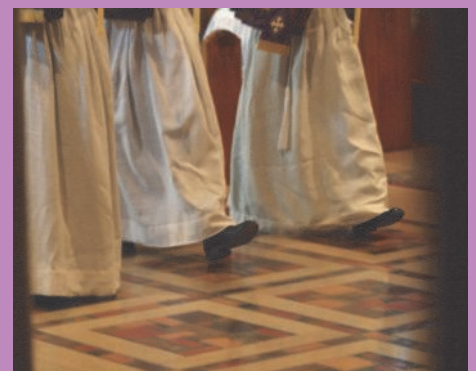
At the moment the three seminarians made their step forward—as a sign of their assent to embrace the service of the altar—their vocations were made certain.