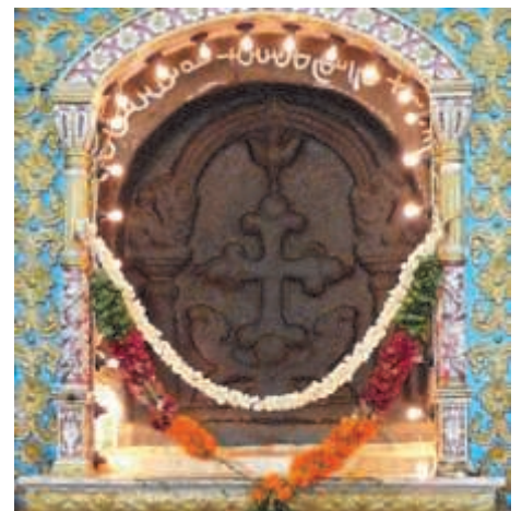
The Bleeding Cross of St. Thomas was discovered while digging foundations.

In Madras (Chennai) on 3rd – 4th September, Catholics from seven Indian Mass centers convened for a pilgrimage visiting the three “High” places of St. Thomas’ activity in Madras. On the 3rd, pilgrims