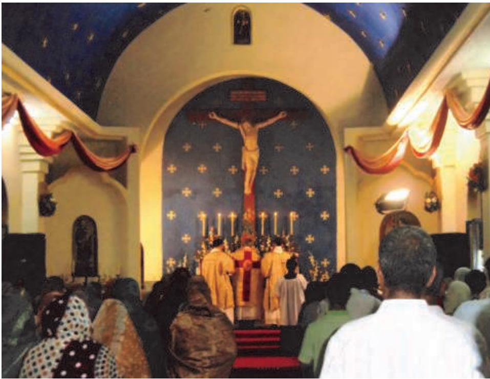
The Madras pilgrimage began with a Solemn High Mass followed by all night adoration in the splendid new St. Anthony's Chapel.