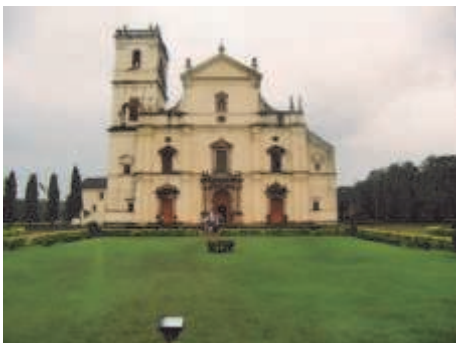
The Se Cathedral, the see of Missionary Asia for over 200 years, was the terminus point of the Goan Pilgrimage of Tradition.

Lest they be out-done, the Parishioners of Bombay walked all night from 14th