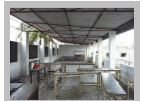
St. Anthony's Chapel (see opposite page, far left) was built on the roof of St. Anthony's School. This is what it looked like before construction started.

September to the morn of the 15th, the Feast of Our Lady of Sorrows. Starting with an evening Solemn High Mass at the old Portuguese cross planted on the shore of Bombay Island in the 1500s, pilgrims walked all night following the traditional 16 km route of the Bombay Marian Pilgrimages. At the feet of Mount Mary in the early morning, Pilgrims assisted at the Solemn High Mass, praying the Lord of the Harvest and His Glorious Queen to send us many more labourers for the restoration of Catholic Tradition! Ω