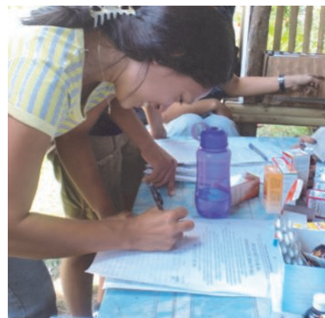
Signatures were gathered at several medical missions, in a shopping mall, at a petrol (gas) station, in a primary school, outside a gym (the volunteers even bullied a seven-belt world boxing champion to sign) and at a funeral.