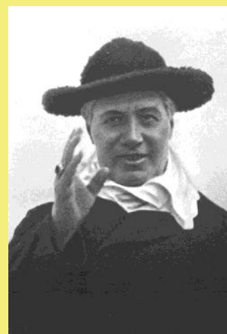
Pope St. Pius X, ready for action.

represents the authority of God. They take to heart the interests of the people, especially those of the working and agricultural classes, not only by inculcating in the hearts of everybody a true religious spirit (the only true fount of consolation among the troubles of this life) but also by endeavouring to dry their tears, to alleviate their sufferings, and to improve their economic condition by wise measures. They strive, in a word, to make public laws conformable to justice and amend or suppress those which are not so. Finally, they defend and support in a true Catholic spirit the rights of God in all things and the no less sacred rights of the Church. (§7)