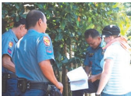
Three policemen were arrested by a volunteer and ordered to sign the petition against the RH Bill.