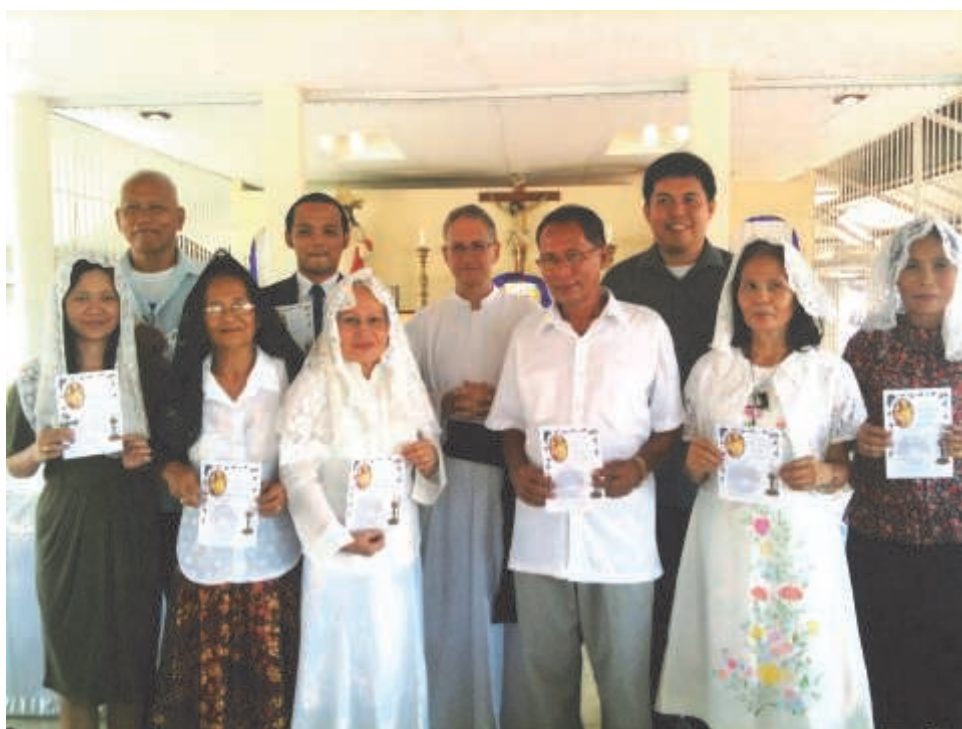
Nine souls were received into the Third Order of St. Pius X at Cagayan de Oro on 11th March 2012. These are the first in the 20 years of the Philippine mission, but they will not be the last for there are more preparing to be received in October or November 2012.