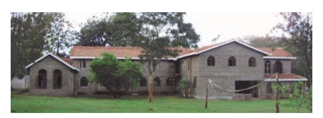
Our Lady of Angels House

Contact: ourladyofangelsnoviciat@gmail.com