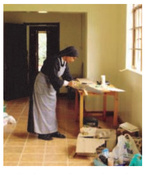
Sister has a great devotion to St. Joseph

The whole community also has some moments of relaxation. Every day the sisters go for a walk after lunch for about half an hour, and on second Wednesdays, the novices and postulants go for a long walk for the whole afternoon. On the last Wednesday of the month the whole community goes out for a picnic at a green park where they spend most of the day in innocent games, not forgetting, of course,