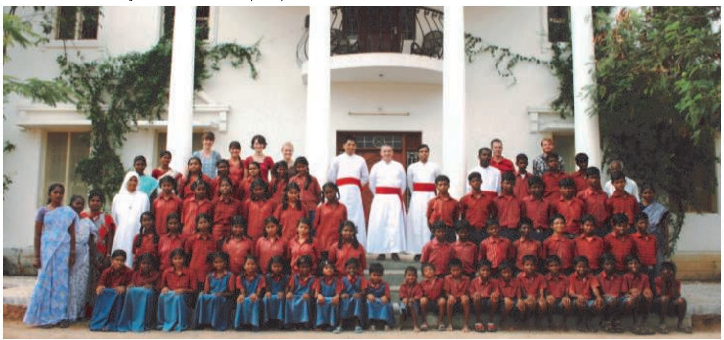
Veritas Academy 2011-12.

May God grant us priests, teachers and plenty of children for our schools. May Catholic parents receive the grace to love their children enough to make the sacrifices necessary for their Catholic education. May our heavenly Mother, our Sedes Sapientiae , hold our schools in her tender care. \Omega