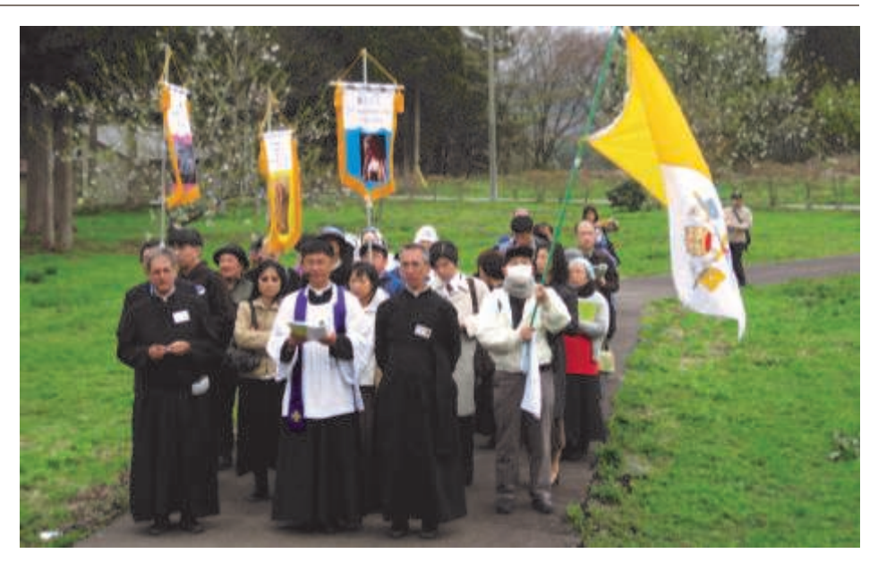
"Many men in this world afflict the Lord. I desire souls to console Him to soften the anger of the Heavenly Father. I wish, with my Son, for souls who will repair by their suffering and their poverty for the sinners and ingrates." And so a small group of pilgrims offer their prayers as reparation.

"Are you truly decided to become the rejected stone? My novice, you who wish to belong without reserve to the Lord, to become the spouse worthy of the Spouse, make your vows knowing that you must be fastened to the Cross with three nails. These three nails are poverty, chastity, and obedience. Of the three, obedience is the foundation. In total abandon, let yourself be led by your superior. He will know how to understand you and to direct you."