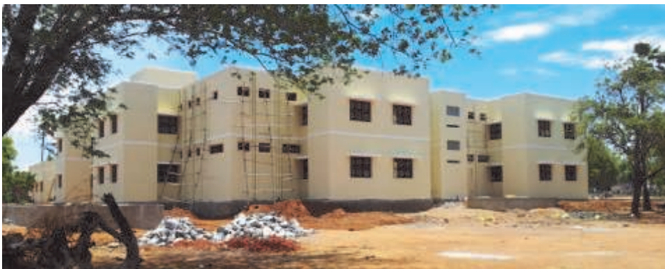
The new 40 room wing of the orphanage is complete after two years of construction.