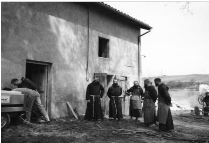
Building work on the vineyard house