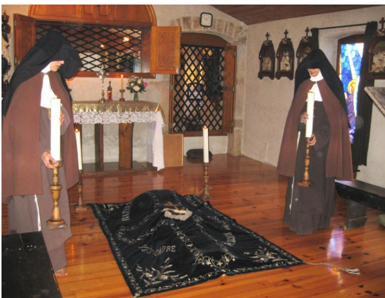
Solemn profession ceremony: the future professed lies in prostration under the pall during the litany of the saints.

By her vows, the religious professes before the Church and the world that she belongs to Christ. Henceforth, all her actions, down to her most obscure and lowly 'services', belong to the Church and are raised to 'acts of worship', producing by them an unsuspecting force - which obtains grace for souls, while "filling up what is wanting to the sufferings of Christ" (St. Paul, Col. I, 24). Even the liturgical prayer she performs is no more a personal prayer, but becomes the prayer of the Church - said with the whole of creation in the name of the Church. Such is the privilege of the religious state over all others.