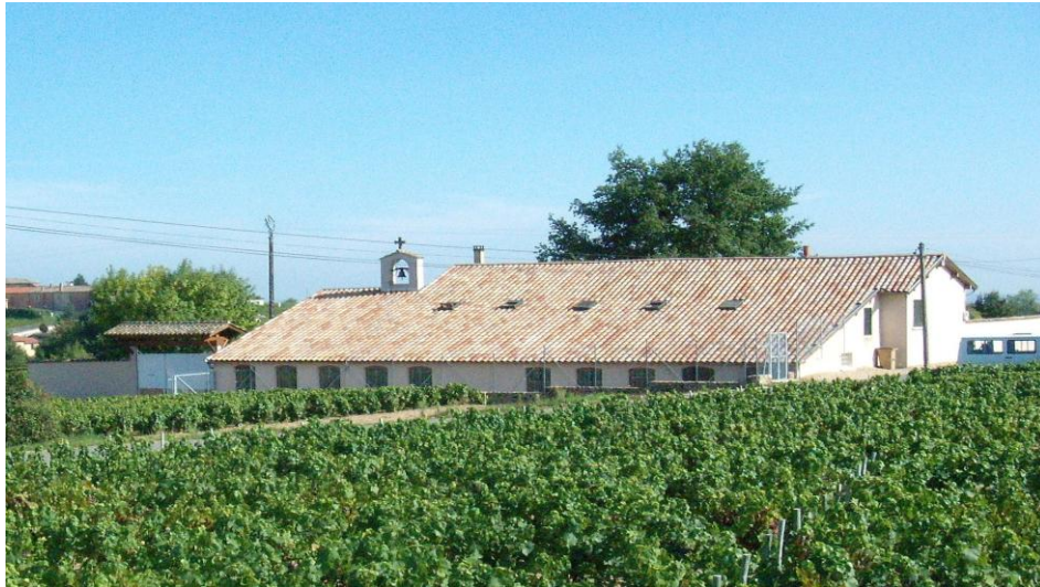
The Convent of Saint Clare, Morgon, France

The convents and monasteries consecrated to prayer are permanent witnesses to the existence of God. They are the precious jewels of Holy Church, the most pure riches of a world that hardly knows they are there. For all those trying to make sense of this world, and their lives, these convents are a light on a candlestick. The peace, joy and simplicity that reign there bear witness to the solid foundation on which the convent rests and much could be learnt there on how to build a life on an indestructible foundation. These convents are spiritual fortresses opposed to the materialism which forfeits so many good values; these are reserves of pure christianism for a decaying Christendom.