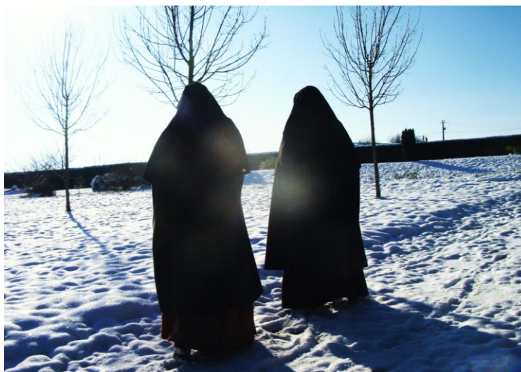
“O ye ice and snow, bless the Lord: Praise and exalt Him above all forever” (Dan. 3,69)

Aspirants should have a great desire to develop a life of prayer and union with God. “She needs a great heart, large enough to embrace the needs of the whole world; delicate enough to live joyfully and peacefully with all her sisters; strong enough to follow Christ on the way of the Cross; and so open to His grace that the Virgin Mary’s ‘Fiat’ may always find an echo in her. Then she will know that it is in losing one’s life, that true life is found; that the deepest joy comes from union with the living God; and that spiritual motherhood is given to those for whom Christ is all”.