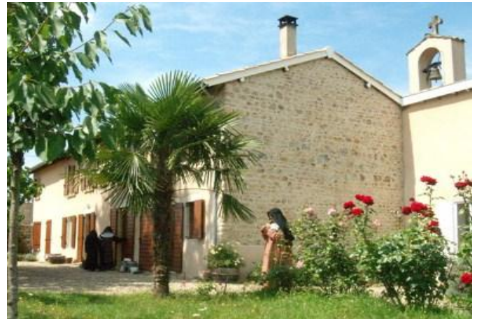
The new convent up and running