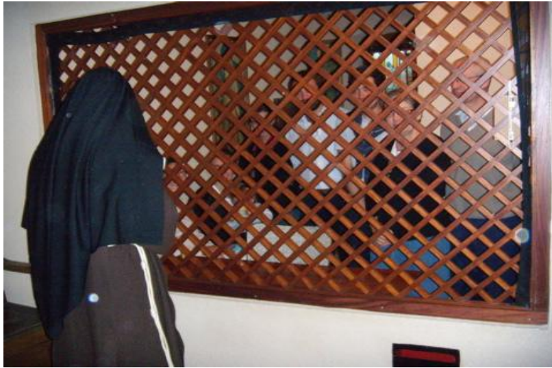
The 'parloir' (visiting room)

Confession and spiritual direction are provided to the nuns by the Capuchin Fathers.