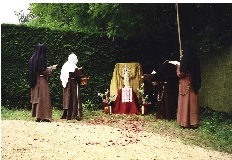
An altar in honour of the Sacred Heart. The Poor Clares have a particular devotion to the Sacred Heart and to the Passion of Our Lord