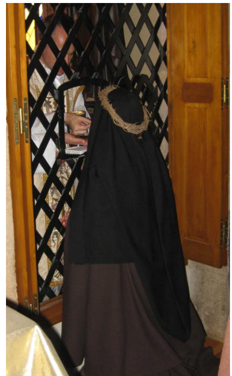
The newly professed, crowned with thorns, receives communion.