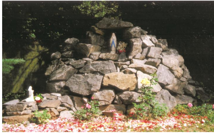
The Immaculate Virgin is the Patron and Queen of the Seraphic Order and the Divine Shepherdess of the community (the community are consecrated to Mary, who they hold as their true Mother Abbess)