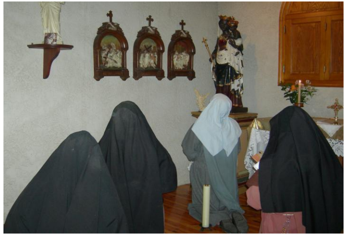
Stations of the Cross

“Orare et Laborare”, “Pray and Work” - is the nuns’ life as well as the friars’. St. Francis said in his testament “I worked with my hands and I want to continue working; I firmly wish that all the friars work in honest occupations”. Diligent work forms part of the normal penance of the Poor Clare, as for all poor people. Their work includes: sacristy duties, sewing (priest’s vestments, sacristy linen, habits), sandal making, book binding, the fabrication of religious items (statues, rosaries etc.), gardening (maintenance, flowers, fruit and vegetables), cooking, laundry, chant practice (for sung masses and ceremonies) as well as secretarial work and the general upkeep of the convent. Works more particular to the Poor Clares of Morgon include the making of the Saint Joseph scapulars (the community are consecrated to St. Joseph) and the Franciscan Third Order scapulars. Also, the ‘Grain of Saint Colette’ 1 - a long-standing Poor Clare tradition to obtain a happy birth.