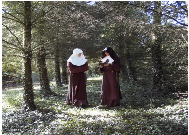
Novice mistress and novice

A mistress of novices is assigned to watch more particularly over each novice, to teach and guide their conduct, while initiating them into the monastic customs - in preparation for the temporary vows of poverty, chastity, obedience and enclosure which they will take at the end of their noviciate. Their temporary vows will last for three years, at the end of which they are renewed - lasting in total for at least six years, after which, the religious is admitted to solemn vows.