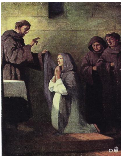
Saint Francis giving Saint Clare the habit

Clare was eighteen years of age when, in 1212, Saint Francis came to preach the Lenten course in the church of Saint George in Assisi. The inspired words of the Poverello (the poor little man) kindled a flame in the heart of Clare. She sought him out secretly and begged him to help her that she might too live “after the manner of the holy Gospel”.