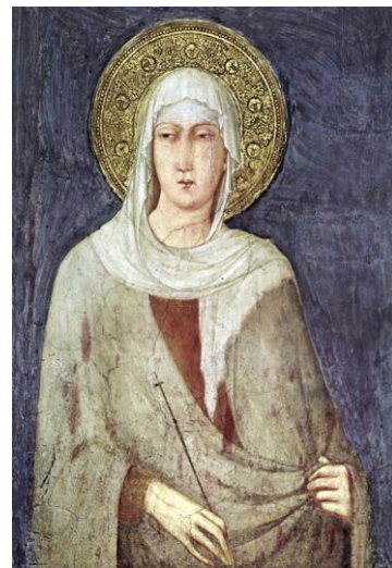
Saint Clare of Assisi

At the beginning of his conversion, six years prior to this meeting, while St. Francis was repairing the walls of the poor chapel of Saint Damien, God revealed to him that “Nuns will live here a life of such holiness that they will shine like a light in the whole Church”. St. Francis saw in Clare the beginnings of this prophecy’s fulfilment, recognizing her as a chosen soul destined by God for great things and foresaw that many would follow in her footsteps.