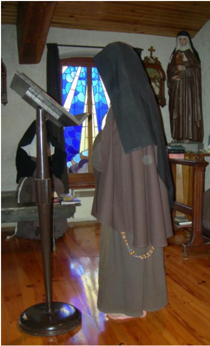
Reading of the Martyrology