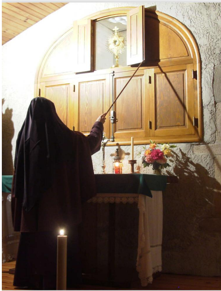
Exposition of the Blessed Sacrament