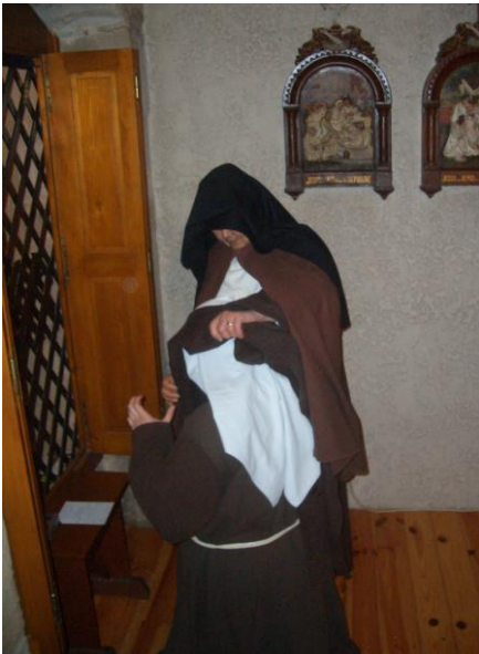
Clothing ceremony: a postulant receives the habit